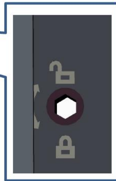
美觀包邊設計 屏體間鷹勾鎖彼此扣緊